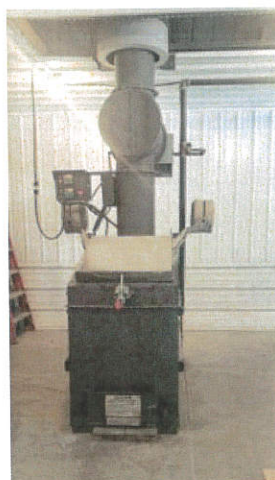
P16-SC4 Incinerator for small Animal Cremation

Click on the veterinary incinerator and pet crematorium below to read the unique benefits.