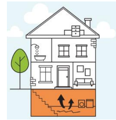
Radon enters your home through the soil or water.

Testing is the only way to know if your home has a radon problem that needs to be fixed.